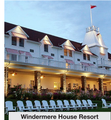
Windermere House Resort Sold Aug 2016 / 56 keys