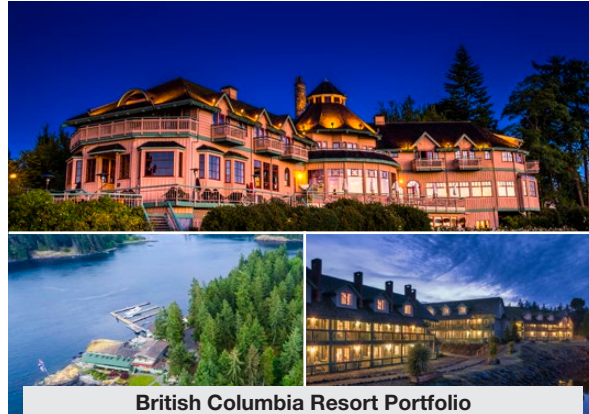
British Columbia Resort Portfolio Sold Dec 2016 / 196 keys