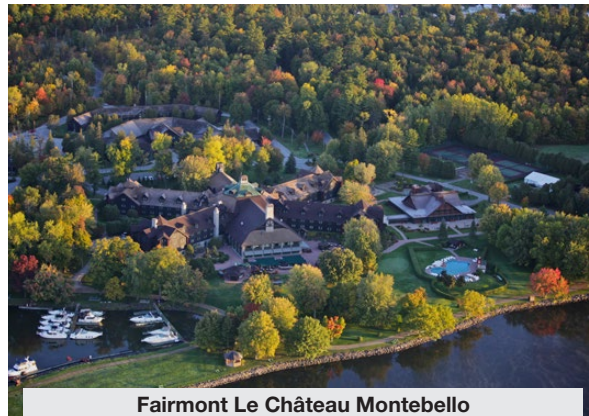
Fairmont Le Château Montebello Sold Dec 2014 / 211 keys