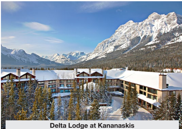
Delta Lodge at Kananaskis Sold Sep 2015 / 412 keys