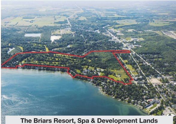
The Briars Resort, Spa & Development Lands Sold May 2017 / 100 keys

Advisor in the sale of 22 resorts since 2006 totaling over $2 billion in volume. Recent experience includes: