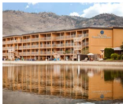
Coast Beach Hotel Osoyoos, BC