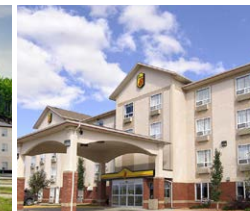
Super 8 by Wyndham High Level, AB