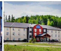
Lakeview Inn & Suites Slave Lake, AB