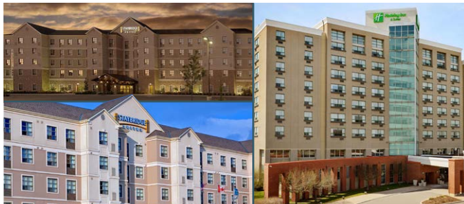
Easton's Ontario Hotel Portfolio / 3 Hotels / 380 keys