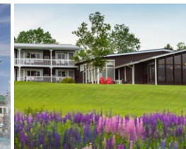
Silver Dart Lodge Baddeck, NS