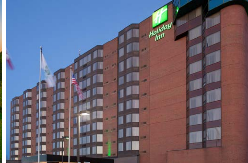
Holiday Inn Ottawa East & Development Lands Ottawa, ON