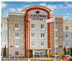
Candlewood Calgary Airport, Calgary, AB