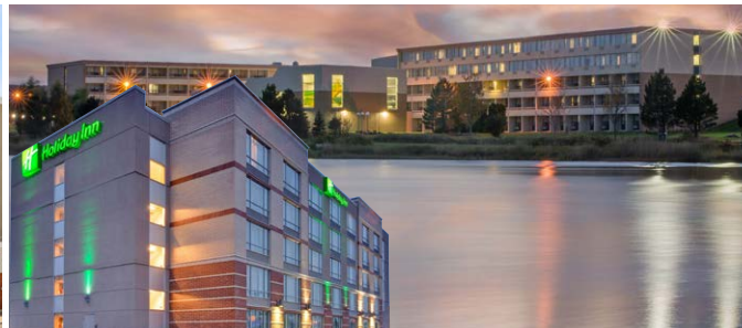
Westfort Hotel Portfolio / 2 Hotels / 486 keys (NF/ON)