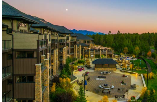
Copper Point Resort Invermere, BC