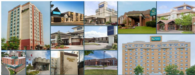
Diversified Canadian Hotel Portfolio / 12 Hotels / 1,752 keys (NF/QC/ON/SK/AB)