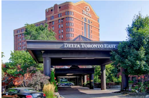
Delta Toronto East & Development Lands Toronto, ON