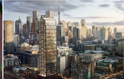
319-323 Jarvis Street Re-Development Site Toronto, ON