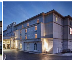
Best Western Plus Orangeville, ON