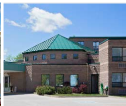
Best Western Inn on the Bay Owen Sound, ON