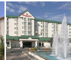
Ramada Plaza Calgary Airport, AB