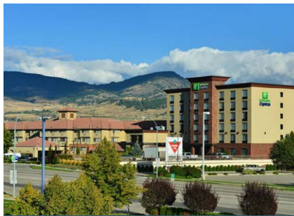
Holiday Inn Express / Kelowna, BC